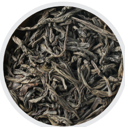
Bolaven Black Tea