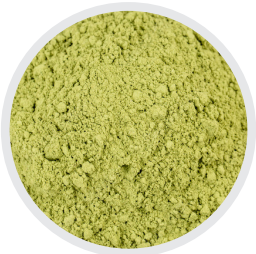
Black Henna Powder